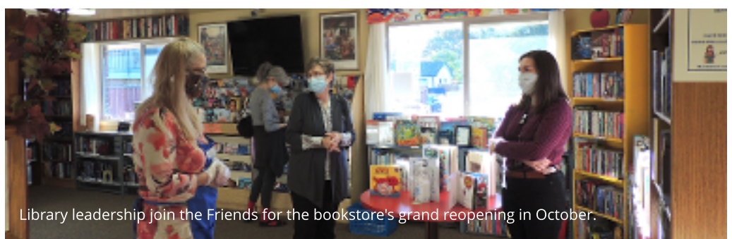
Library leadership join the Friends for the bookstore's grand reopening in October.

Browsers has been open for over a month and is showing a reasonable income — covering our overhead — and we're now putting money back into the Library fund.